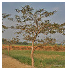
Young Tree at Kolkata, West Bengal, India