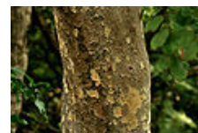
at Ananthagiri Hills, in Rangareddy district of Andhra Pradesh, India.