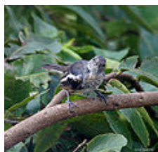
Bark with Immature Oriental Magpie Robin at Kolkata, West Bengal, India