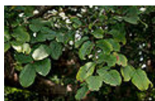
at Ananthagiri Hills, in Rangareddy district of Andhra Pradesh, India.