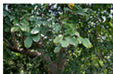
at Ananthagiri Hills, in Rangareddy district of Andhra Pradesh, India.