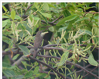
Flowers with Sykes's Warbler Kolkata, West Bengal, India.

Terminalia arjuna is a medicinal plant of the genus Terminalia , widely used by ayurvedic physicians for its curative properties in organic/functional heart problems including angina, hypertension and deposits in arteries. According to Ayurvedic texts it also very useful in the treatment of any sort of pain due a fall, ecchymosis, spermatorrhoea and sexually transmitted diseases such as gonorrhoea. Arjuna bark ( Terminallia arjuna ) is thought to be beneficial for the heart. This has also