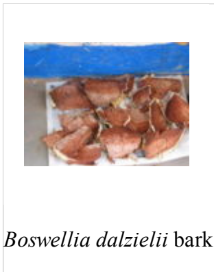
Boswellia dalzielii bark