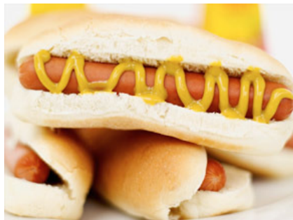
People who ate Western diet, high in red meat, fats, were more likely to have a recurrence of colon cancer.